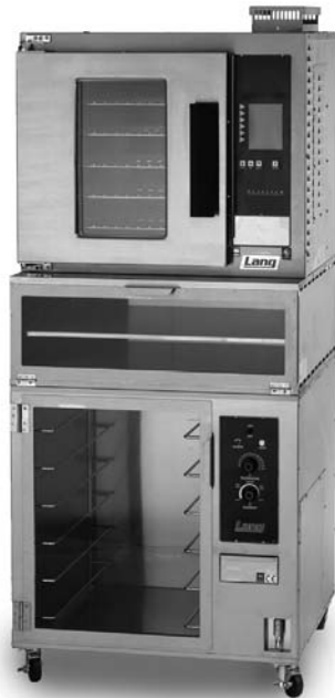
Model MB-PT shown