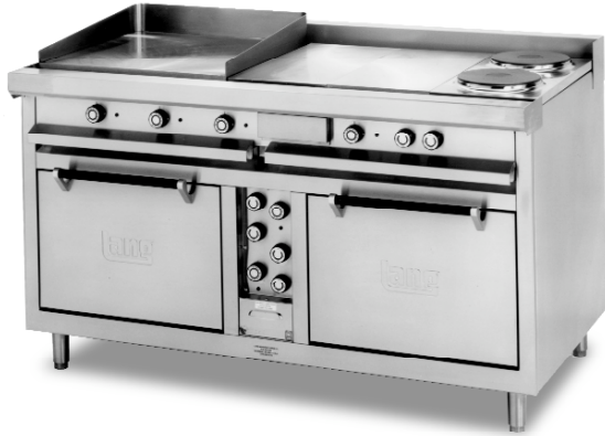
Model R60S-ATC shown