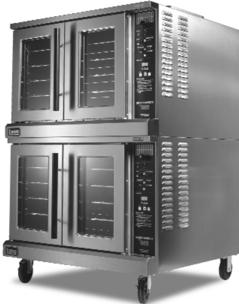
Model ECOF-AP2 shown